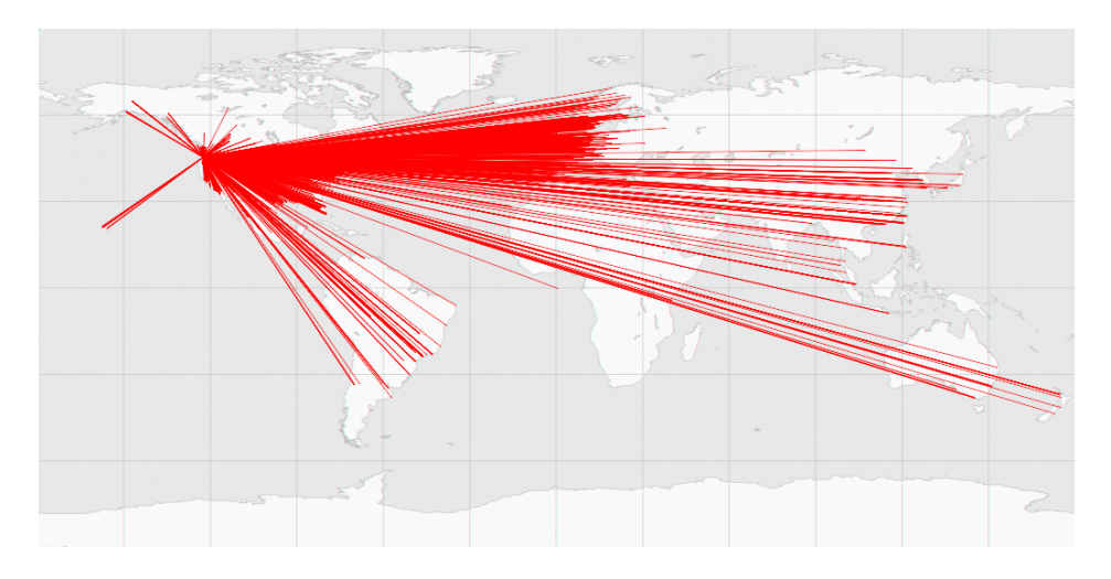
Figure 1: Overflow connections on cs.mshmro.com 6/17/03-6/19/03

day simply due to being full. Figure 1 shows a map of the world with a line drawn between cs.mshmro.com and every client who tried to connect but found the server full during a 48 hour period (there are 5400 lines). Ideally, full game servers would be able to redirect potential clients to other servers, perhaps to servers even better suited to the client needs. Our service provides a scalable, centralized, redirection architecture by which servers with high load can, instead of dropping clients when full, redirect the clients to a server that meets client needs, as well as improving the overall connectivity of the network. The management of where these clients go is completely handled by a redirection master, a service locatable anywhere on the Internet. We envision the application of this service to any public-server game, such as Quake, Half-Life, or Neverwinter Nights, as well as any network service that runs on a large number of geographically distributed servers (i.e. a geographic "anycast").